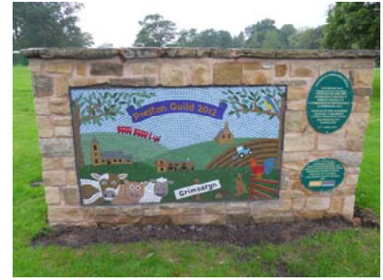
Grimsargh Guild Mosaic.